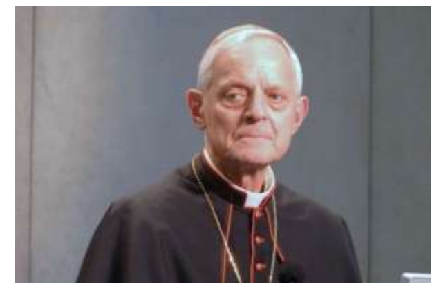
Wuerl denies he was informed of Vatican restrictions on McCarrick