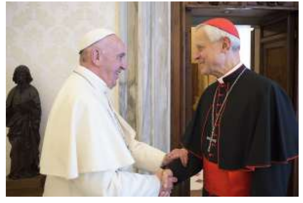
Who might follow Cardinal Wuerl in DC?