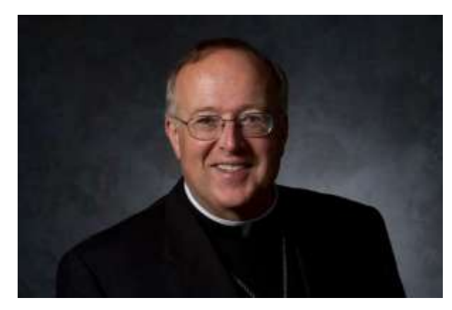
Questions raised about McElroy's response to 2016 McCarrick allegations